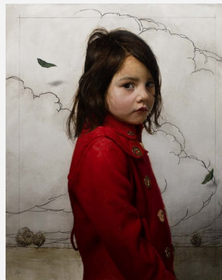
2022 First Place Painting Mark Pugh, Girl in a Red Coat in Early Spring , 16x20", Oil, ink, graphite