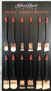
BADGER BLEND AND WHITE BRISTLE