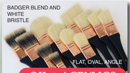
FLAT, OVAL, ANGLE