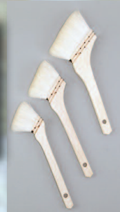
DRESSED GOAT HAIR