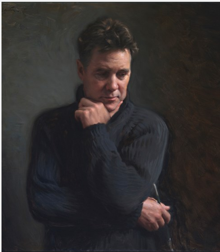
2023 Draper Grand Prize Paul Newton Self-Portrait in Lockdown , 34 x 33.50", oil on linen