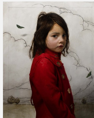
2022 First Place Painting Mark Pugh, Girl in a Red Coat in Early Spring , 16x20", Oil, ink, graphite